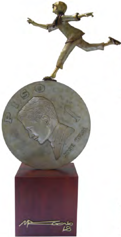
"Piso Power" 17" x 8" x 31"