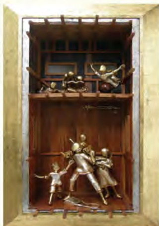
"Our True Wealth" 22" x 12" x 36"