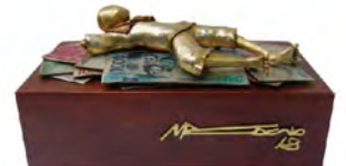
"Relaxing" 14" x 8" x 6"