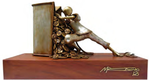
"Nag-uumapaw" 24" x 11" x 14"