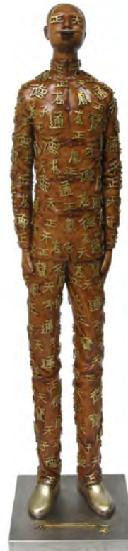
"Lucky Rich Asian" 14" x 13" x 59"