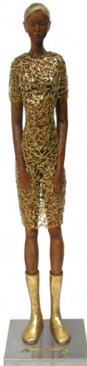
"Lovely Rich Asian" 14" x 12" x 57"