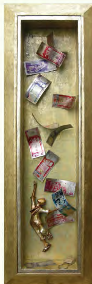
"Ulan ng Biyaya" 47" x 11"