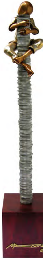
"Embrace" 8" x 8" x 39"