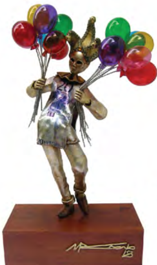
"Payaso" 12" x 7" x 22"