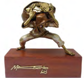
"Harvest" 12" x 6" x 13"