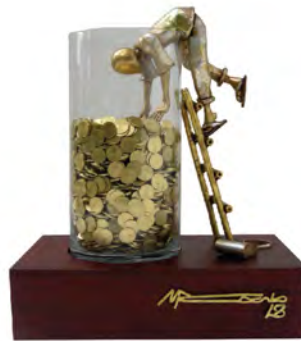
"Great Find" 14" x 8" x 17"