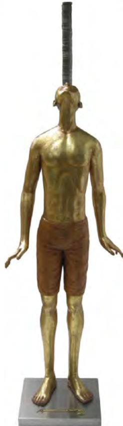
"Prosperity Balance" 20" x 12" x 68"