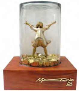
"Life is Abundant" 12" x 12" x 15"