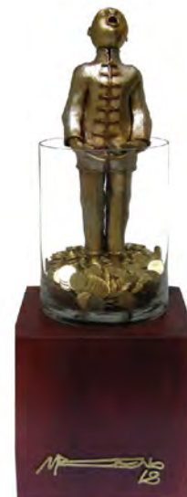
"168" 8" x 8" x 22"