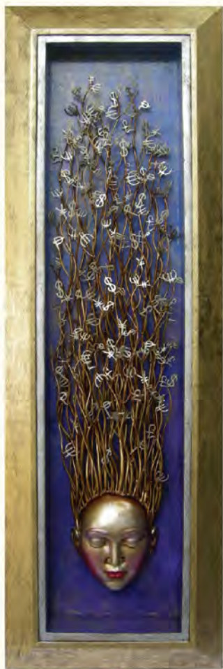
"Hair Fortune" 47" x 11"

Cacnio's art has since evolved to feature a diverse array of themes including his world renowned collaboration with Lego , his extremely popular balloon series, his controversial yet coveted Erotica figures and of course his newly launched Abundance opus. This glorious series focusing on prosperity brings out his explorations of new materials such as wood, aluminum, glass, stainless steel and found objects. "For this show, my simple wish is for all of us to be abundant as a nation together." Simple wish indeed but profound nonetheless, not unlike his soul captivating artworks made of ingenuity, imagination and sheer joy.