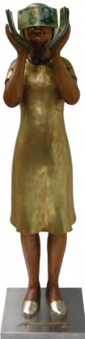
"Happy Rich Asian" 14" x 12" x 51"