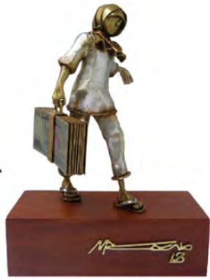
"Bulto" • 12" x 9" x 17"