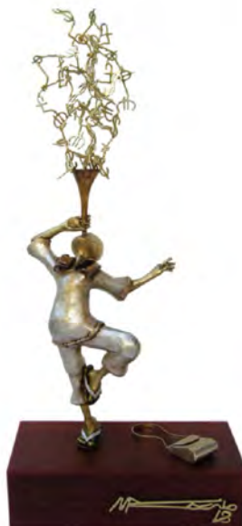
"Blown of Fortune" 12" x 6" x 28"