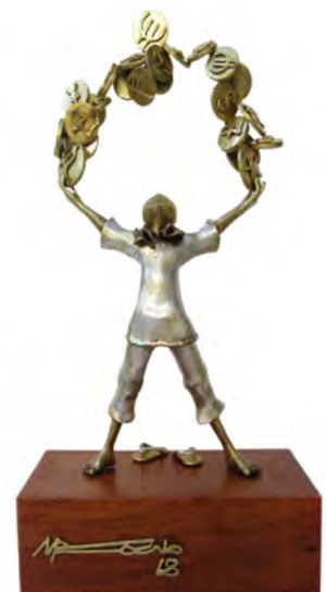
"Rainbow of Blessings" 12" x 8" x 21"