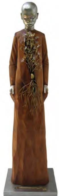
"Seed of Abundance" 13" x 14" x 49"