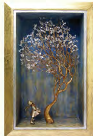
"Fortune Tree" 26" x 8" x 38"