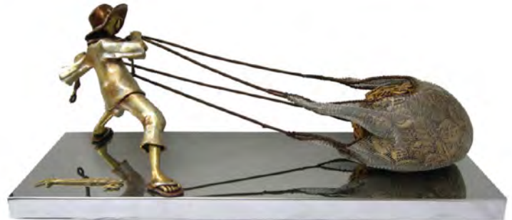
"Abundant I" 30" x 12" x 12"