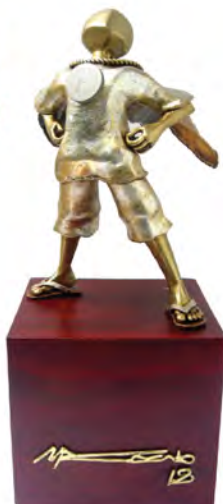
"Super Peso" 9" x 10" x 20"